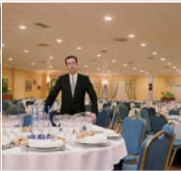
Restaurants & Hotels