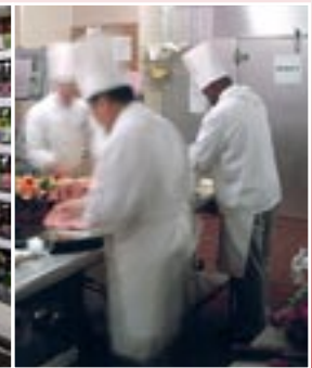
Cafeterias & Commercial Kitchens